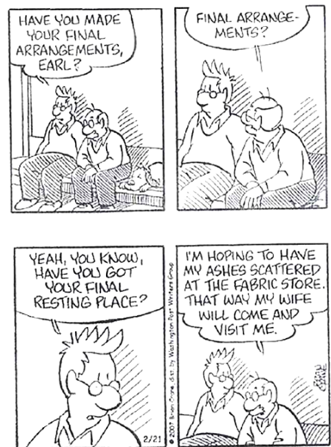
Pickles by Brian Crane

I love fabric. It follows me home from the quilt guild meeting. Scraps stick to my fleece jacket and won't let go. I have naught to do but make scrap quilts. AC